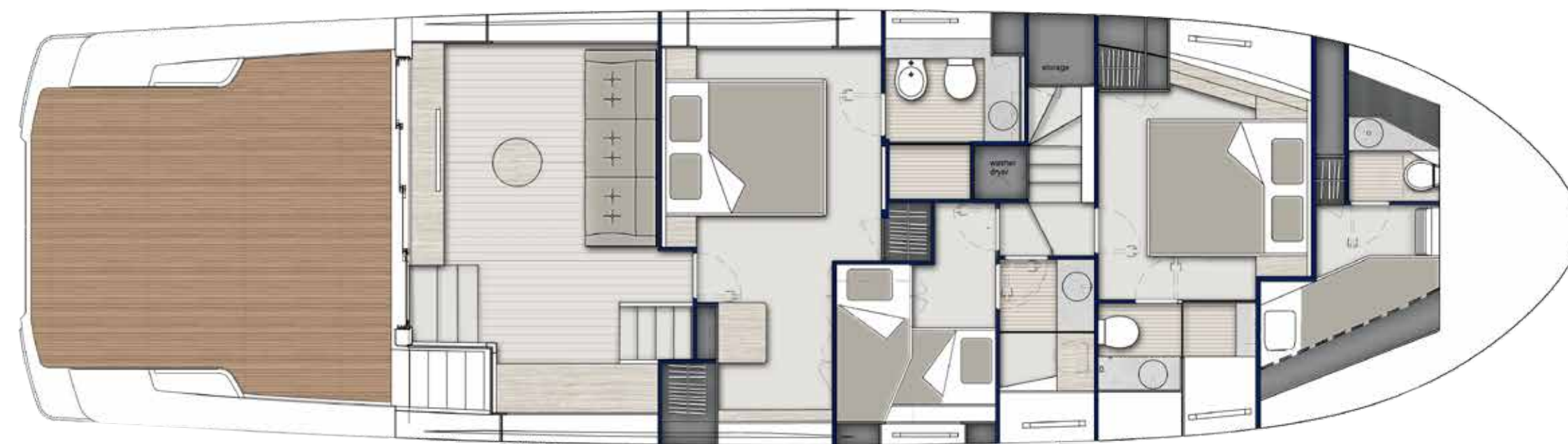
LOWER DECK C