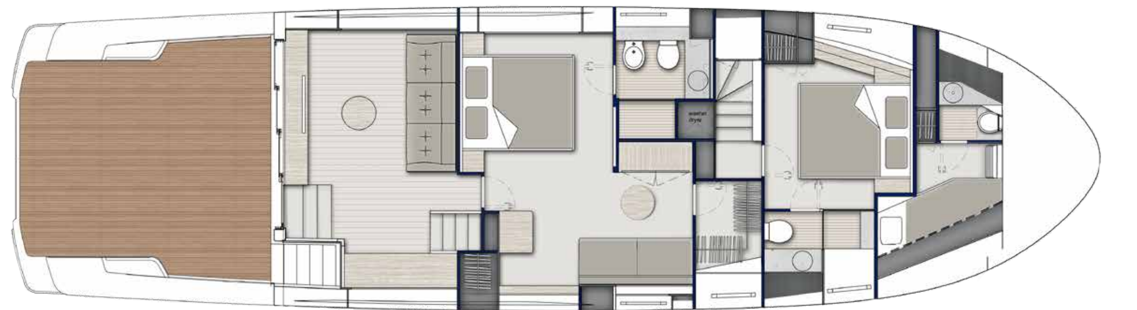
LOWER DECK A