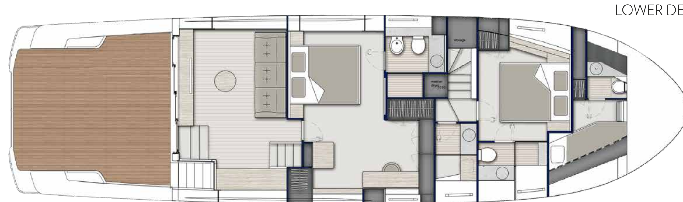
LOWER DECK B